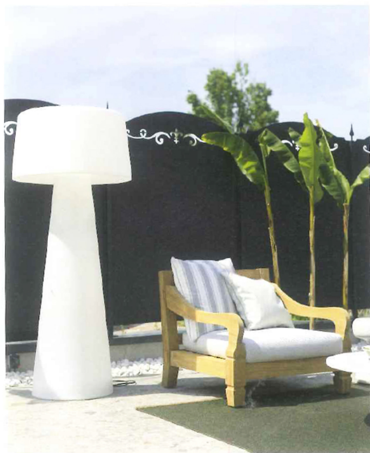
L'ampiezza del giardino che circonda la villa ha permesso di realizzare a bordo piscina anche una pratica area barbecue: tutto è pronto per vivere l'estate (Toso Interni).